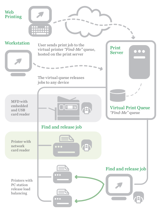
A global print queue provides convenience for end users and helps keep documents secure